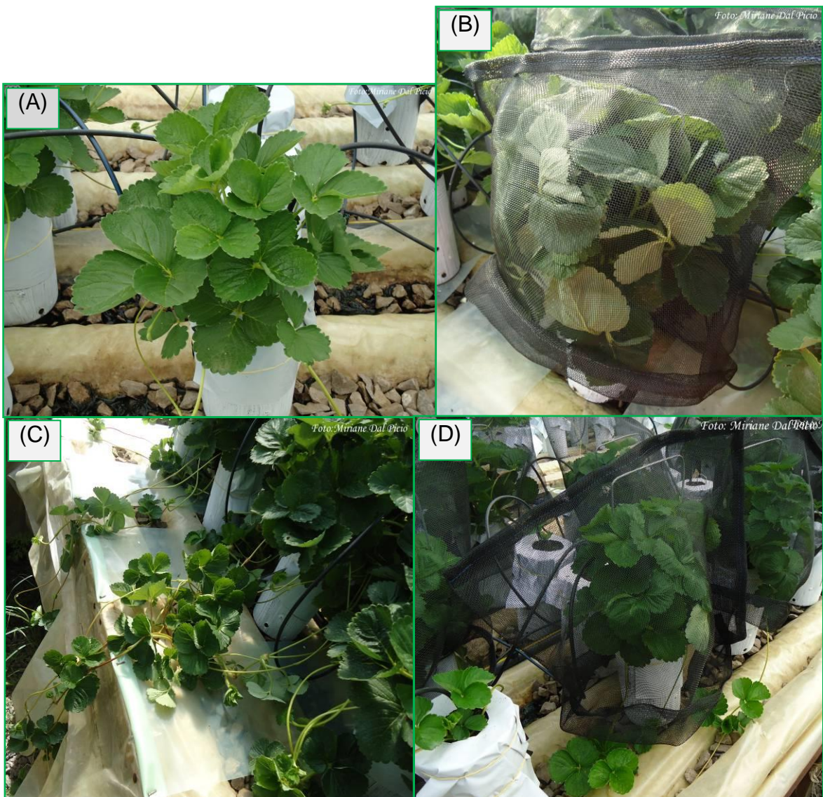
Figure 1- Runner tips collected weekly (T1), in mother plants unshaded (A) and shaded (B). Runner tips collected monthly (T2), in mother plants unshaded (C) and shaded (D).