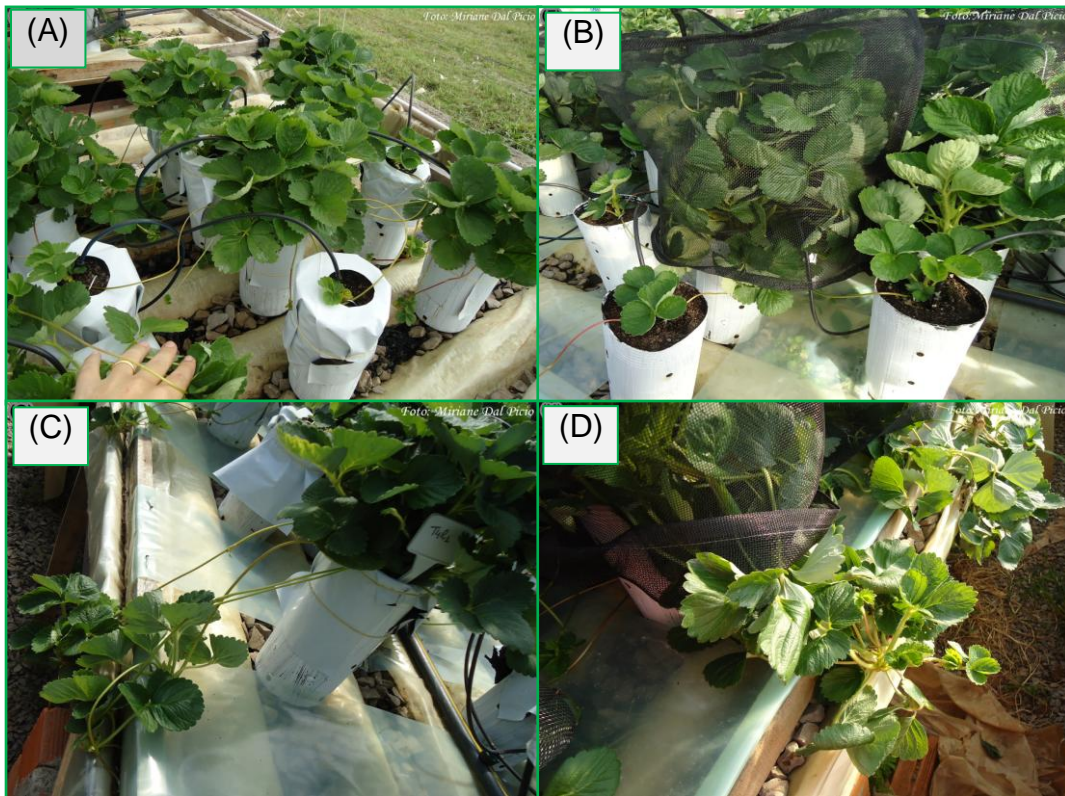
Figure 2- Four stolons with tips rooted (T3), in mother plants unshaded (A) and shaded (B). Four stolons with tips unrooted (T4), in mother plants unshaded (C) and shaded (D).