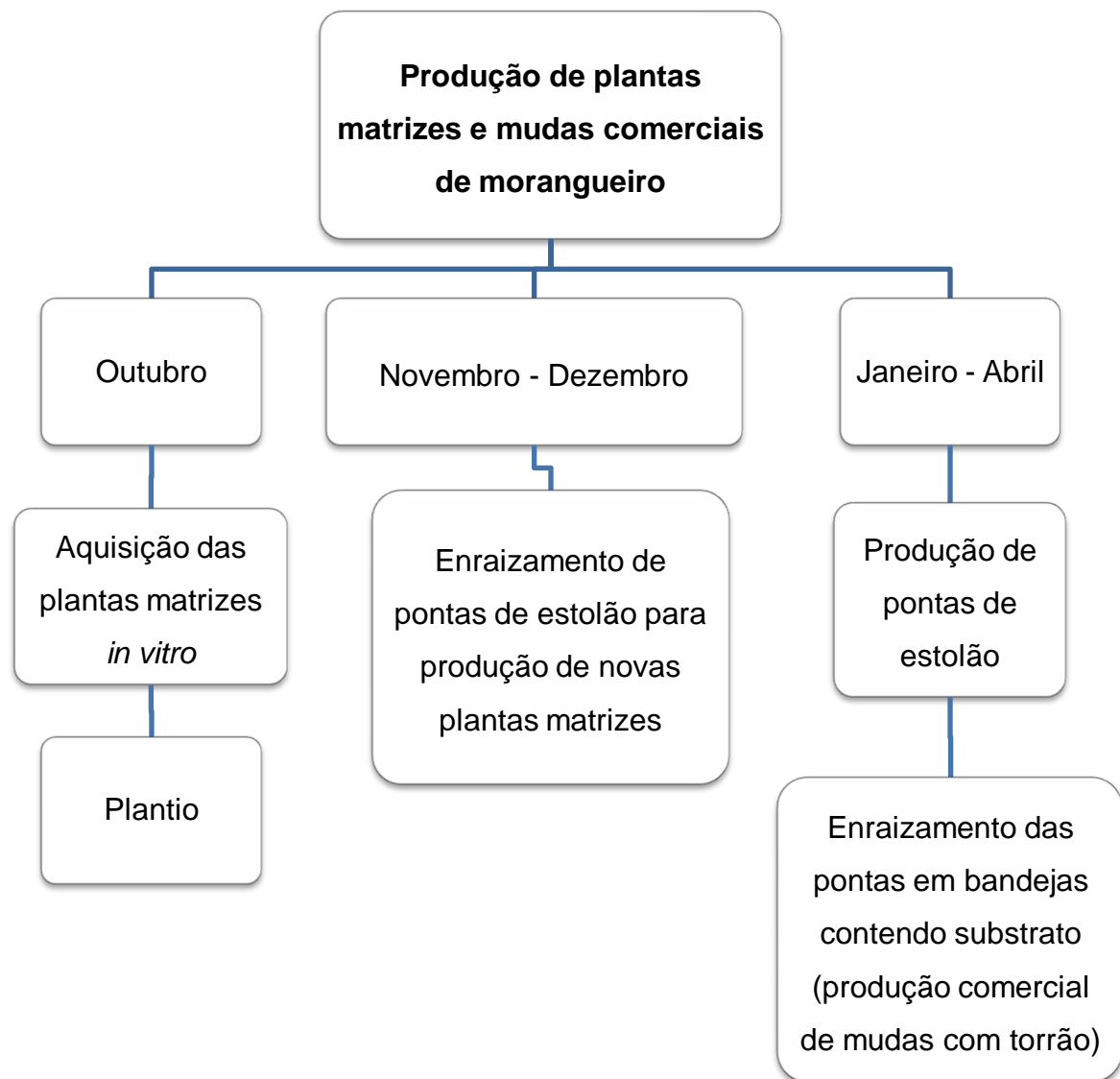
Figura 1. Fluxograma da produção de plantas matrizes e mudas comerciais de morangueiro.